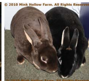
Chocolate vs Black Otter