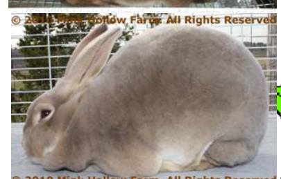
From Top: Chinchilla, Castor, Lynx